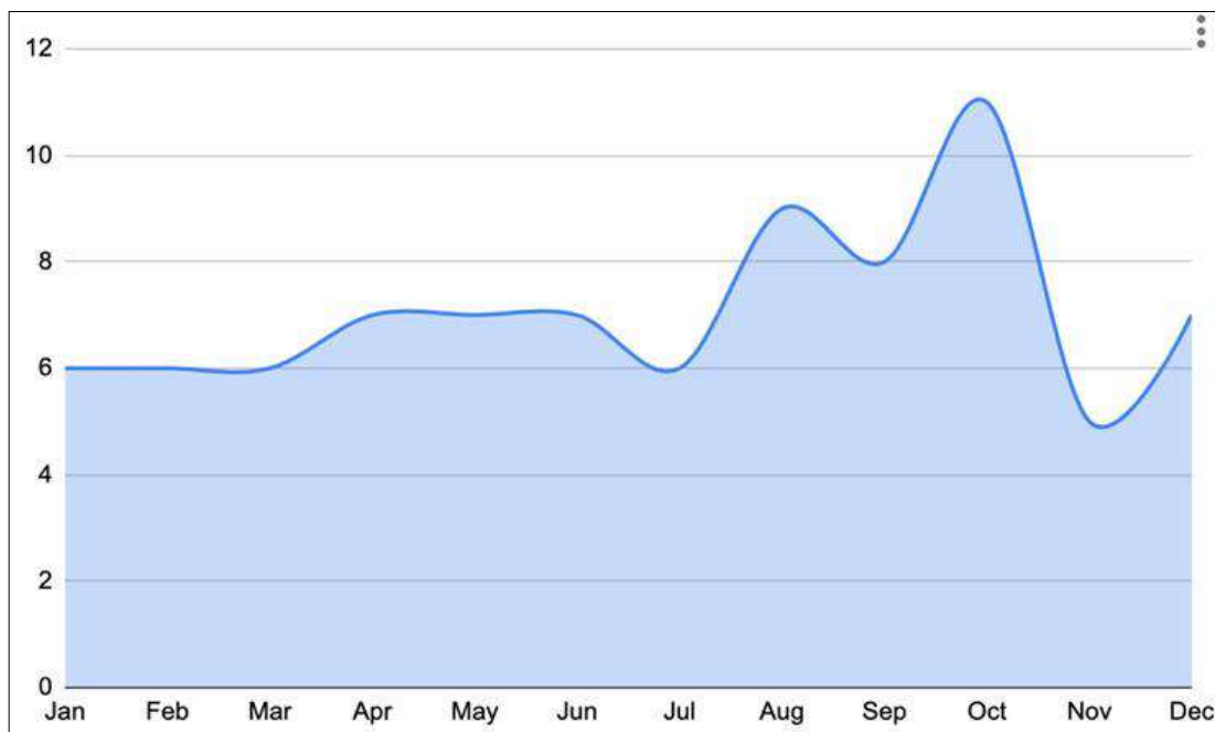
Picture 1: Graphical representation of variation of incidence of poisoning over months in a year